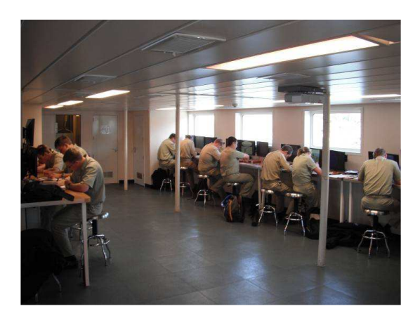
Figure 6 Cadets using the IBEST

The NavLab was completed in 2011 and fully utilized for training during the Golden Bear 's training voyage of May and June, 2012. During the voyage, the 78 cadets enrolled in CRU 100 received five days (approximately 30 hours) of radar and ARPA training in the IBEST. During that period, 2<sup>1</sup>/<sub>2</sub> training days (approximately 15 hours) were utilized for the teaching and learning of radar plotting techniques for collision avoidance. The remaining 2<sup>1</sup>/<sub>2</sub> days (again, approximately 15 hours) were used for training in radar navigation and the use of ARPA in collision avoidance.