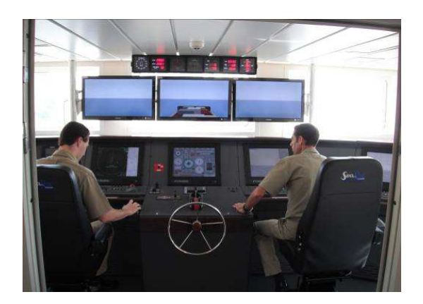
Figure 4 Cadets training on the FMB