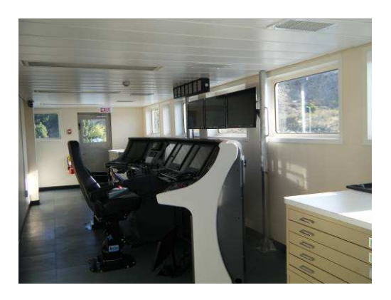
Figure 3 Full Mission Bridge (FMB)