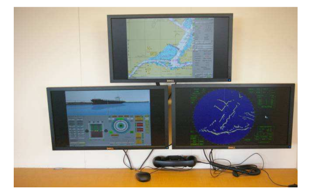
Figure 5 IBEST Student Station